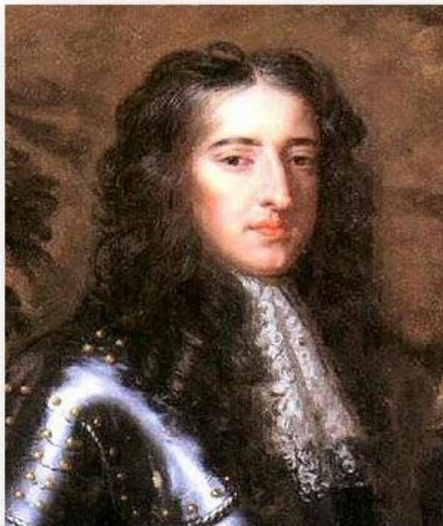
William III of Orange (1650; English King 1688-1702)

as Singapore have their funds frozen when all they had were TBills on deposit. Farmers lost hedge positions. Anyone who wants to really compare the damage, it is 1000 times greater than Madoff and that is conservative. The US had the financial markets that supported it being the Financial Capital of the World.