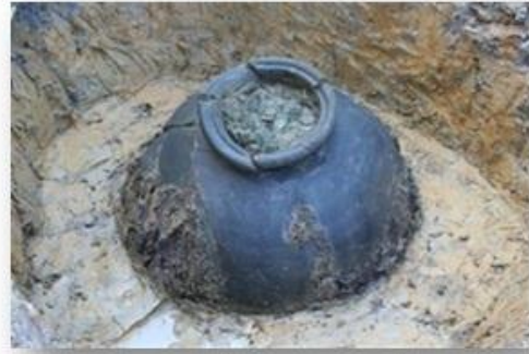
British Hoard Discovered 2007 Containing 52,000 Roman Coins

So how do we deal with this type of crisis? This is why I have been warning we could be at the edge of such a precipice it may be similar to the Fall of Rome where the currency collapses due to inflation, banks lose a sense of safety forcing people to bury their wealth as the only means of security. As St Jerome said, when Rome Fell, they were still laughing! NY would sooner assassinate me than listen to me. So any idea that they will see the light is absurd. The fall is therefore inevitable. So the questions that are coming are in general like the following: