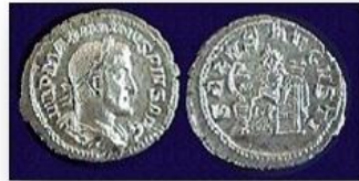
Maximinus I (235-238AD)

accumulative interest expenditure, NOT social spending to benefit the poor. This so called "socialism" is benefiting the "rich" that they hate so much. Eventually there will be NO social spending and 100% of all expenditure will go to the "rich" bankers. Then what will you have? That is the issue not whether some Greek paid taxes.