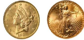
US $20 Gold 1949-1932

Purchasing Power of Gold Fluctuated at all times