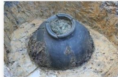
British Hoard Discovered 2007 Containing 52,000 Roman Coins

The MF Global incident, US tracking of all bank wires, the confiscation of Greek's assets in Switzerland is all showing we have very serious problems far beyond what people are arguing about with gold standard nonsense. We are at the threshold of a systemic collapse that no change of what we call money is about to prevent. We may be at the Fall of Rome Stage where people buried their money and didn't trust banks at all. As governments become desperate for money to pay the bankers, it becomes precisely as President Herbert Hoover wrote in his memoirs on page 129: