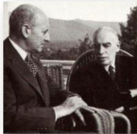
Morgenthau - Keynes at Bretton Woods

The Great Depression ended in each country as they ABANDONED the gold standard. What they are shoving down the throat of Greece right now is the very DEFLATION that was created by a gold standard. Whenever the supply of MONEY contracts and population rises, you create DEFLATION regardless what you are using for MONEY . This is simple reality.