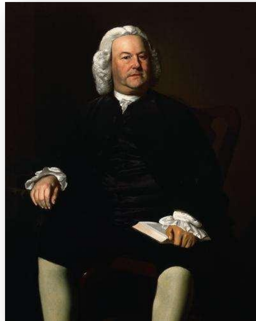
JAMES OTIS, SR. (1702–1778)

defendant is called upon to answer for bruising the grass and even treading upon the soil. If he admits the fact, he is bound to show by way of justification, that some positive law has empowered or excused him. The justification is submitted to the judges, who are to look into the books; and if such a justification can be maintained by the text of the statute law, or by the principles of common law. If no excuse can be found or produced, the silence of the books is an authority against the defendant, and the plaintiff must have judgment."