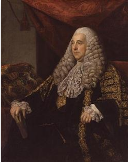
LORD CAMDEN CHIEF JUSTICE (1718-1725)

It was Lord Camden who delivered one of the most celebrated cases in English History Entick v. Carrington and Three Other King's Messengers , 19 Howell's State Trials 1029. It was this case where Lord Camden made one of his most famous quotes: