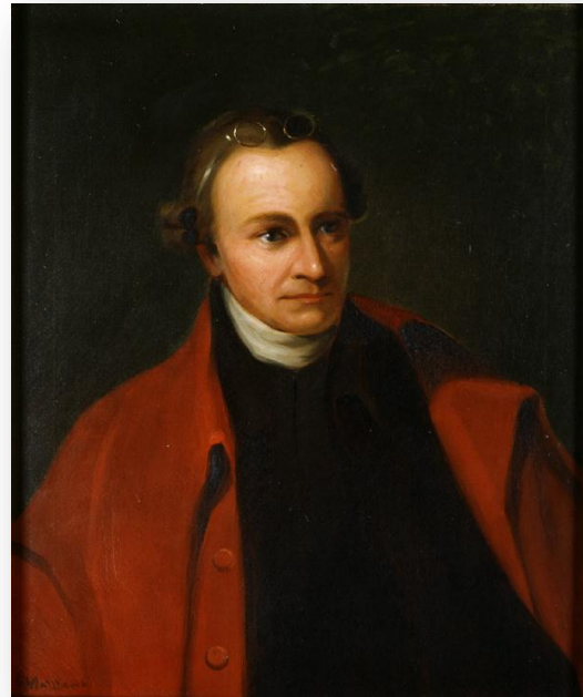
PATRICK HENRY (1736 – 1799)

This is what Patrick Henry meant when he said: “Give me liberty or give me death!” The true definition of LIBERTY is the right to be left alone. The right not to have to prove who you are to petty government officers. And the right not to have your wife and children looked at naked by government employees to get on an airplane for a vacation. This is amazingly the very issue that inspired the rise of a nation and the overthrow of tyrannical monarchy. There were no rights, privileges, and certainly no immunities except for petty government officers who were ABOVE the law as they are again today. If a non-government employee were to strip your 8 year-old daughter, would this not be child molestation? The decision about the extent of your LIBERTY rested, then as now, solely in the hands of government employees. This above all else compelled the American people to resist, for they would no